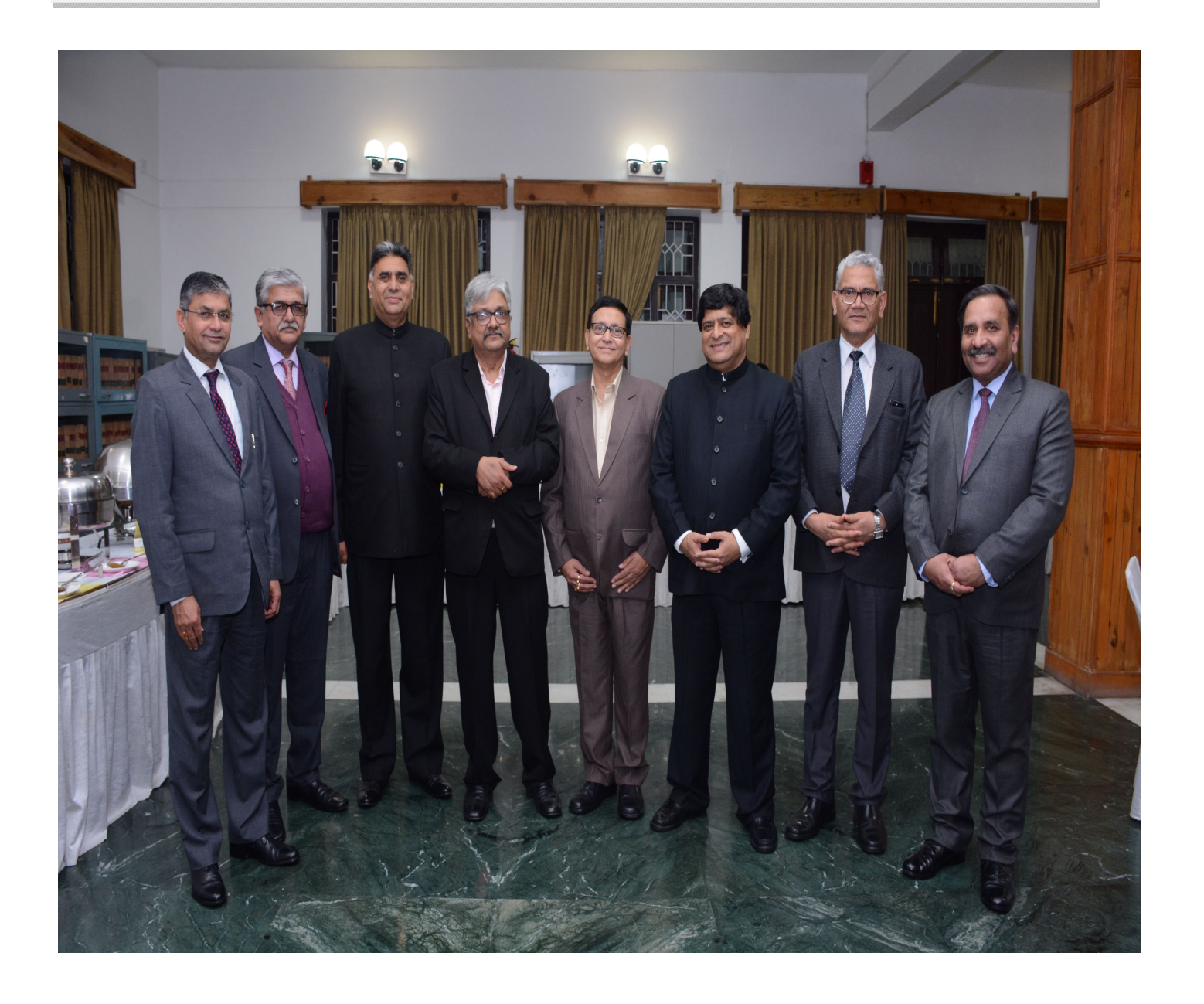
Hon'ble the Chief Justice and Hon'ble Judges of High Court of Uttarakhand on elevation of the Hon'ble Mr. Justice K. M. Joseph, Hon'ble the Chief Justice of Uttarakhand to the Judge of Hon'ble Supreme Court of India.