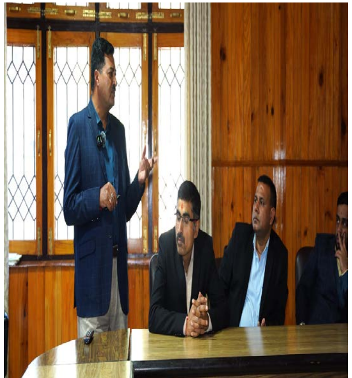
Counseling at ADR Centre