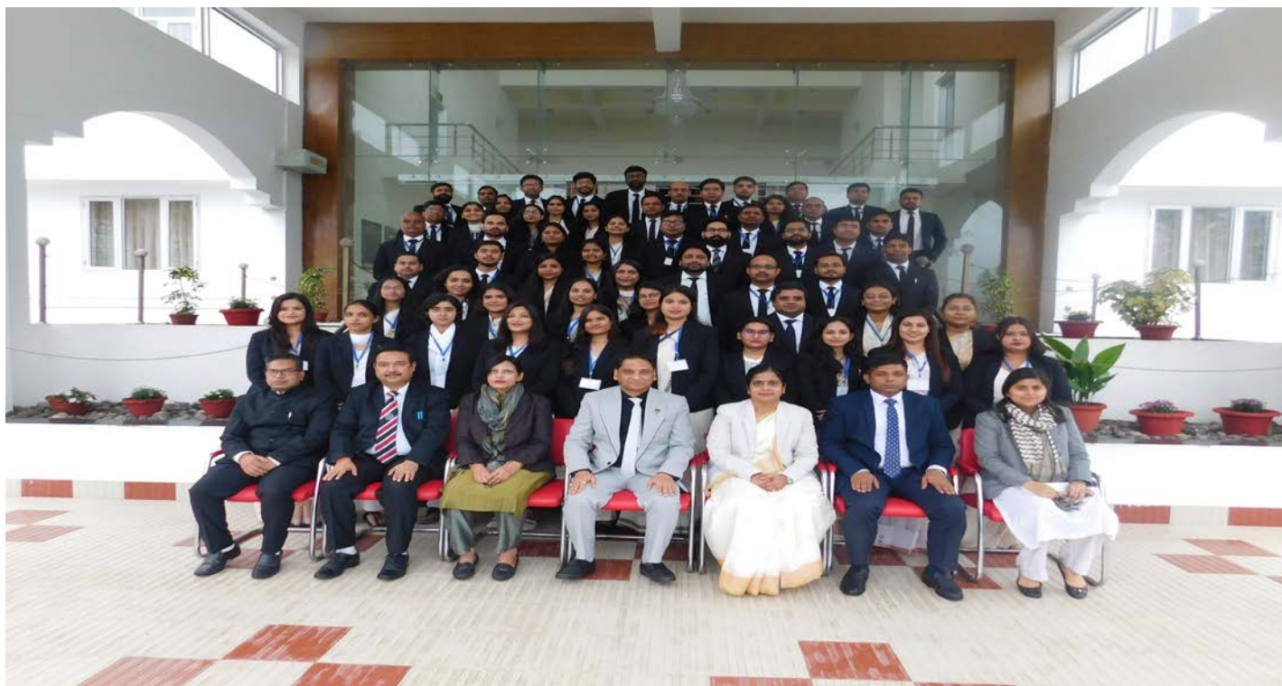
Study Tour/Training Programme of Newly appointed Civil Judges (Jr. Div.)- 2022 Batch of Uttar Pradesh (IInd phase) during the period from 05.07.2024 to 07.07.2024