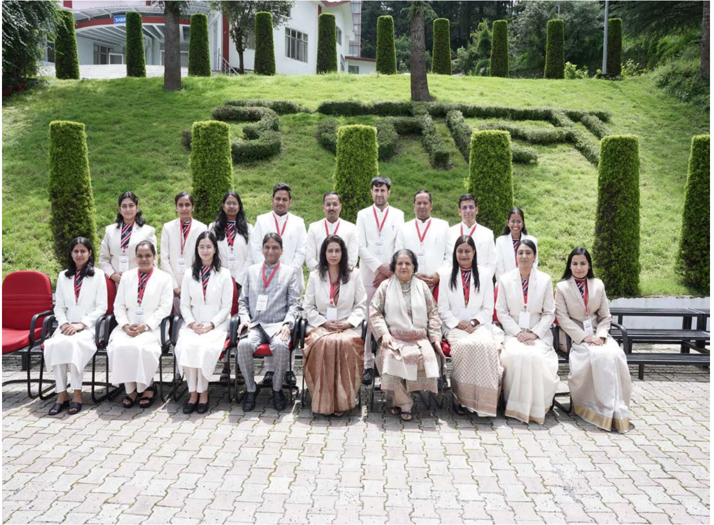
Foundation Training Programme for Newly Recruited Civil Judges (J.D.) 2022 Batch (1 st phase of Institutional Training) during the period from 01.08,2024 to 15.10.2024.