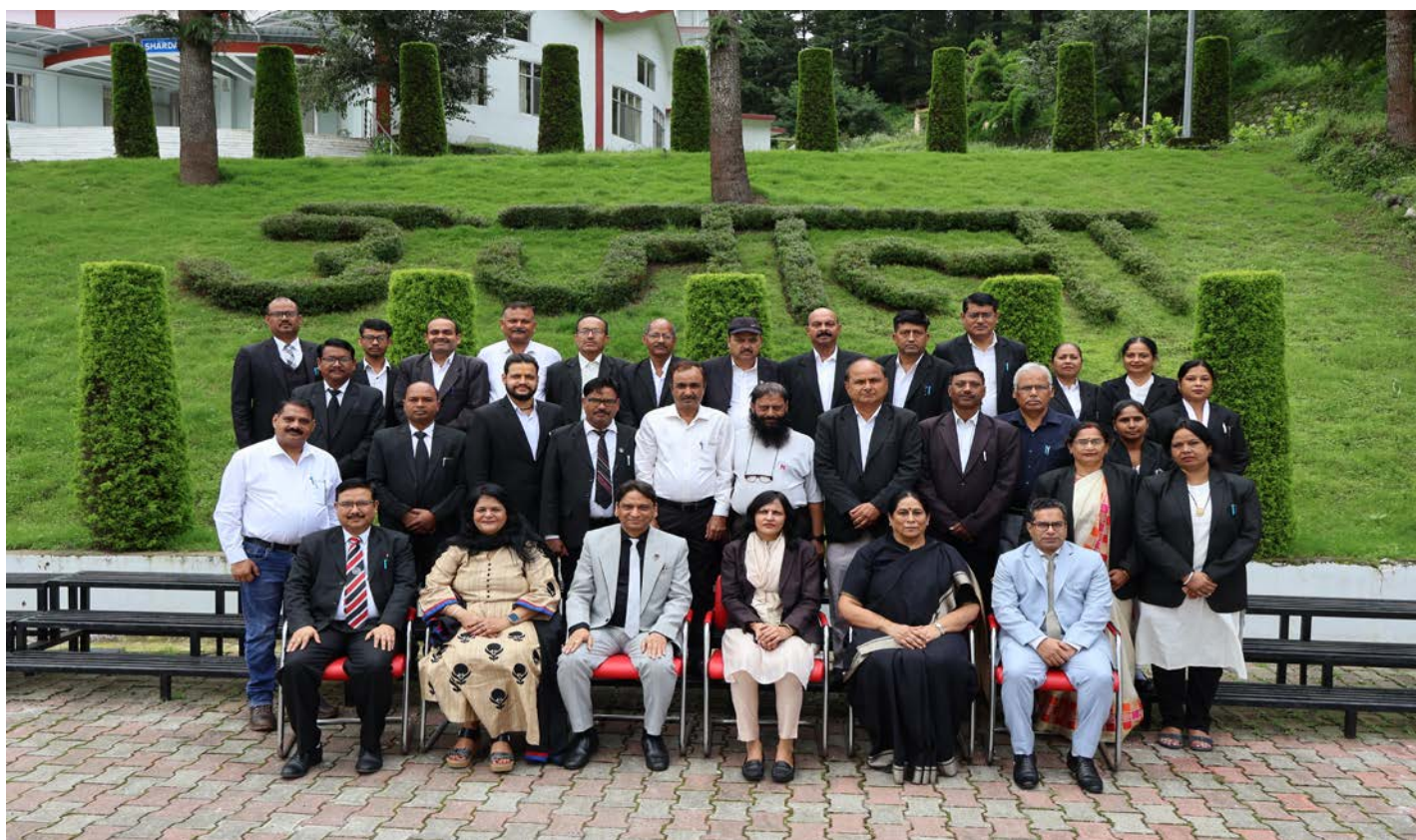
40 hours Training Programme on Mediation for Advocates (1 st Phase) during the period from 05.08.2024 to 09.08.2024