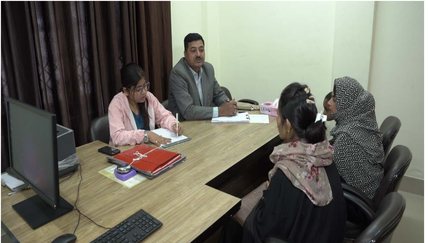
Counselling at ADR Centre