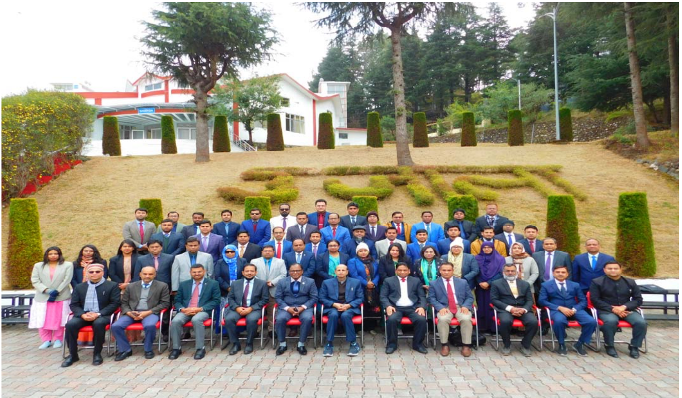
Training Programme for Bangladesh Judges and Judicial Officers during the period from 17.02.2024 to 23.02.2024