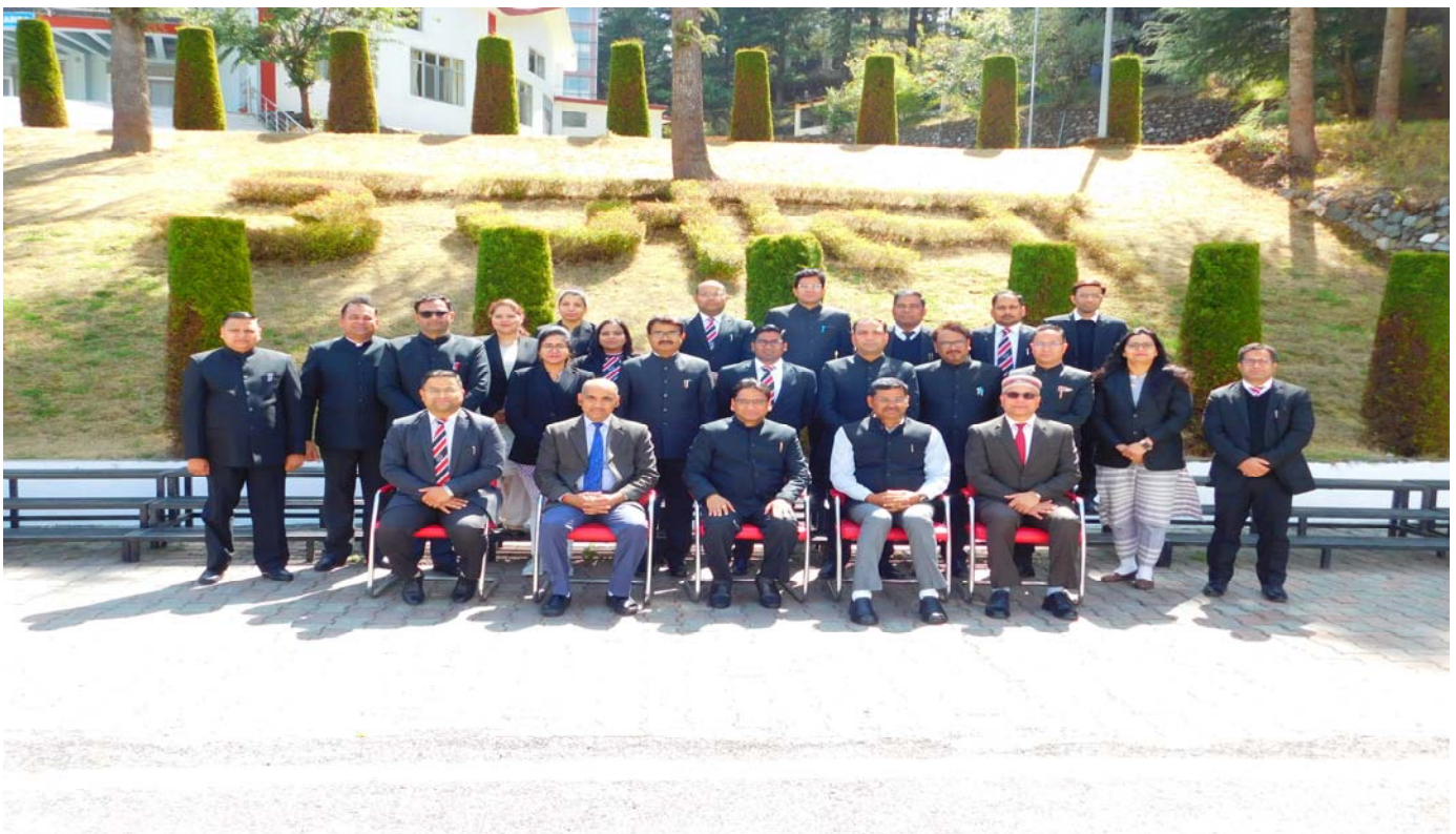
Refresher Course on Criminal Laws and Procedures during the period from 12.03.2024 to 16.03.2024