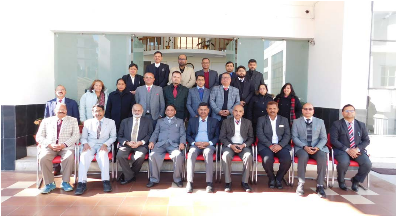
40 hours Training Programme for Advocates of High Court on Mediation (II nd Phase) during the period from 08.01.2024 to 12.01.2024