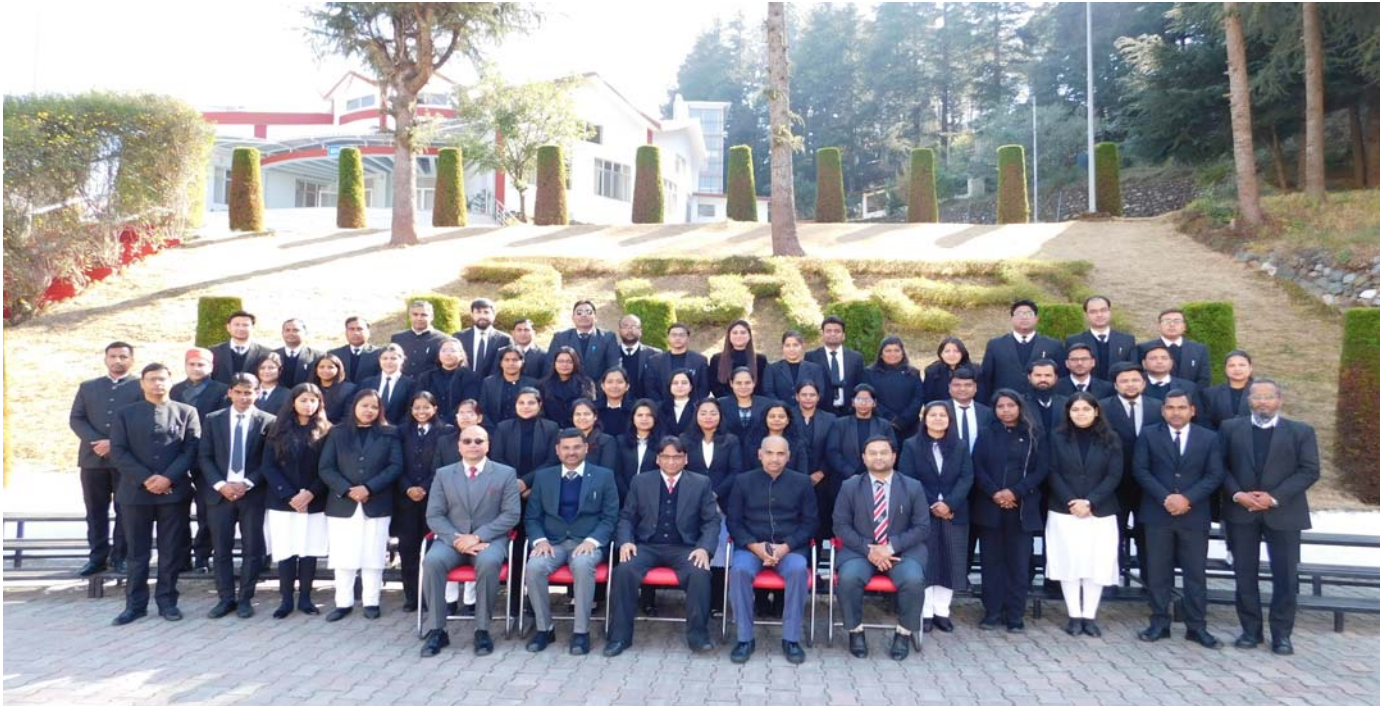
Training for Newly Appointed Assistant Prosecution Officers (APOs) of the State during the period from 02.01.2024 to 31.01.2024